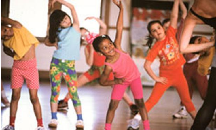
Daily Physical Education